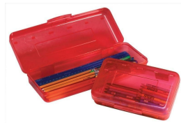
1 plastic pencil box