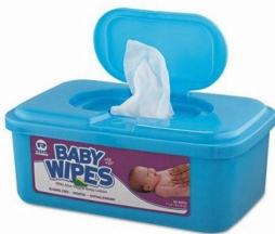
1 box baby wipes