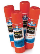
24 glue sticks